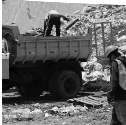
El Panul Landfill gas to energy project, Chile

by promoting good labour standards throughout our supply chain; sourcing fair traded goods and services and adopting and promoting fair trade practices and products; ensuring an honest and fair treatment of our clients and suppliers; and refraining from working with clients or in countries which do not recognise human rights principles.