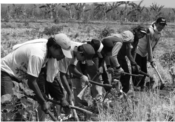
Rajawali Nusranta Biodiesel project, Indonesia

For us corporate social responsibility means applying our principles day-to-day. We believe in 'keeping it real', and aim to ensure that our principles can be put in practice in the company and to those that deal directly with us. In practice this means: