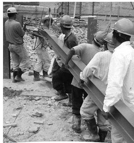
La Esperanza Hydroelectricity project, Honduras

as EcoSecurities is a company promoting sustainable development in a variety of countries, we strongly believe that the best way to achieve this is through employing a diverse and talented workforce with a high degree of cultural awareness and knowledge of local issues and that, in the long term, they can disseminate and retain these values and expertise in their own countries. Our employment policies actively value and promote diversity in terms of gender, age, ethnicity, culture, sexual orientation, nationality, religion and local practices.