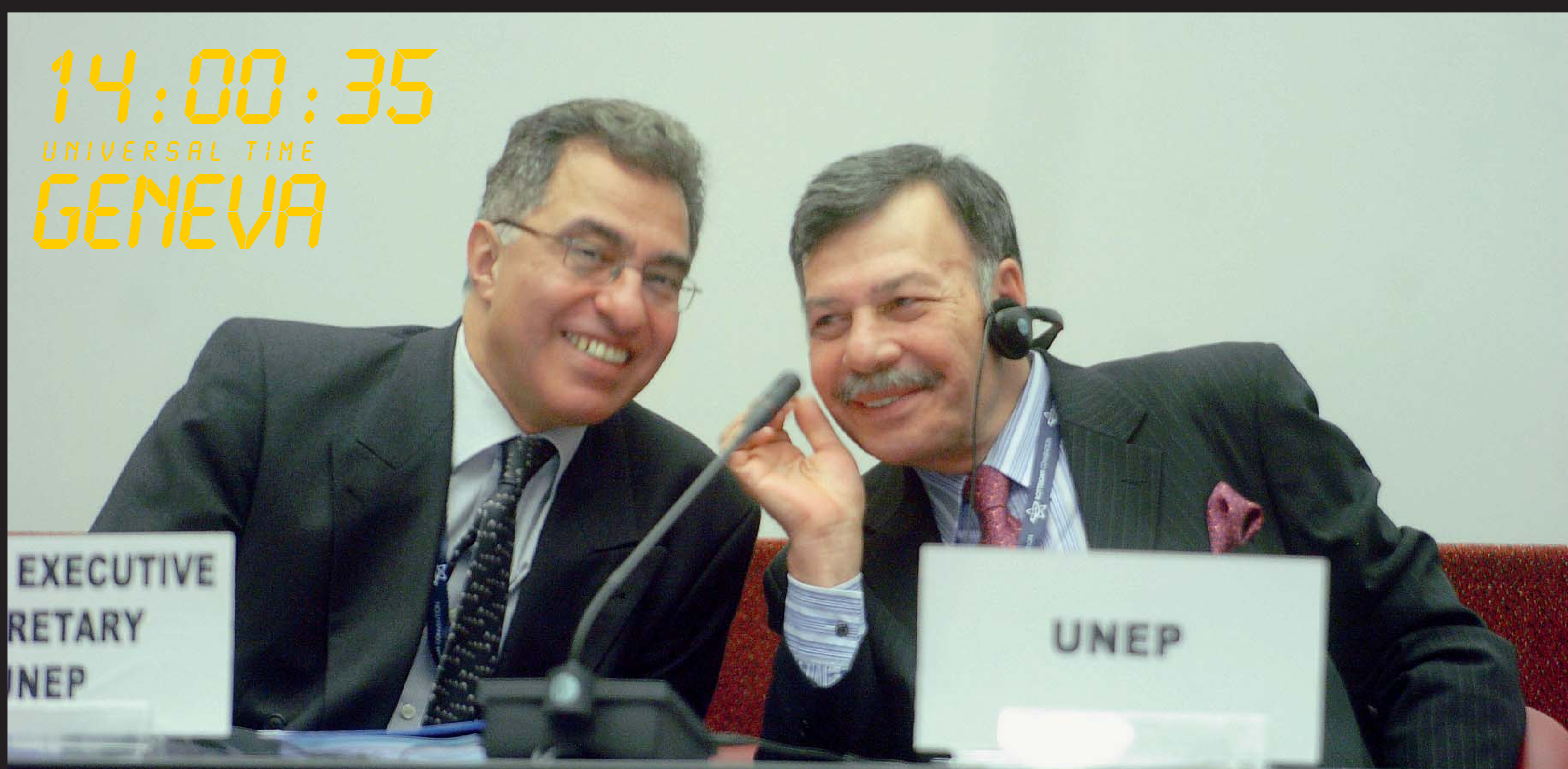
...MAGED YOUNES, HEAD OF UNEP CHEMICALS, AND SHAFQAT KAKAKHEL, UNEP DEPUTY EXECUTIVE DIRECTOR, AT A ROTTERDAM CONVENTION MEETING...

UNEP provides the main catalytic force in the UN system to drive activities related to the sound management of chemicals. It supports access to and exchange of information on toxic chemicals and promotes chemical safety by providing policy advice, technical guidance and capacity building to developing countries and countries with economies in transition.