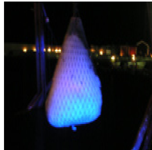
TICKTOCK-TICKTOCK ON SITE IN SOUTHERN SWEDEN