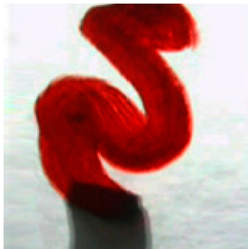
STILL FROM 'WHY RED?'