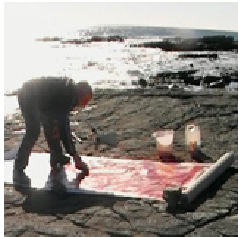
STILL FROM 'ON THE INSIDE'