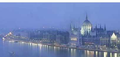
Budapest and the Danube