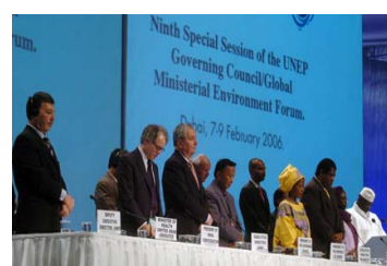
The 9th session of the UNEP Governing Council & Global Environmental Forum