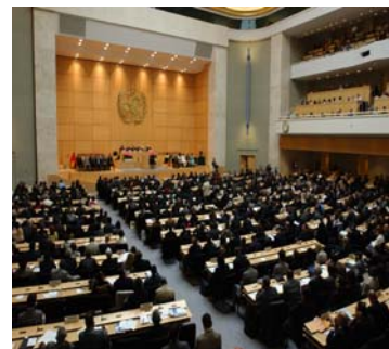
The 59th World Health Assembly

ing Policy Strategy, and the Global Plan of Action. The decision invited other organizations and governments to contribute resources to SAICM and the Quick Start Programme (QSP), make contributions to the QSP Trust Fund, and "provide voluntary extra-budgetary resources in support of the Strategic Approach secretariat in the fulfillment of its functions". Following suit, the UNITAR Board of Trustees in its Decision on SAICM on 27 April 2006 at its 44th session similarly endorsed SAICM and called for its continued support. One month later on 27 May 2006, the 59 th World Health Assembly formally noted SAICM and urged its member states to participate in SAICM implementation, nominate SAICM national focal points, and "take full account of the health aspects of chemical safety in national implementation of SAICM". Governing bodies of other IGOs such as FAO and ILO are expected to take up SAICM in due course. Such actions should help to incorporate the objectives of SAICM into the work programmes of each organization within their respective mandates.