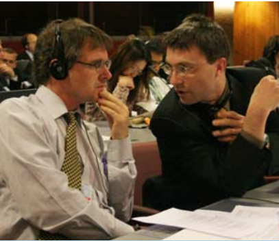
Participants in the synergies contact group during Stockholm COP 2.