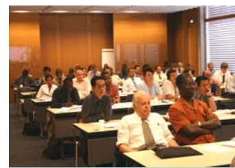
UNITAR's workshop on SAICM gathered over 100 participants