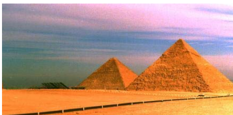
The famous pyramids of Giza, near Cairo