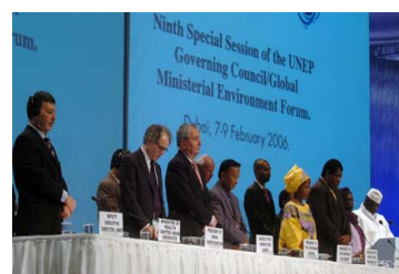
The 9th session of the UNEP Governing Council & Global Environmental Forum