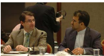
ICCM Delegates worked in a spirit of compromise to finalise and adopt SAICM.