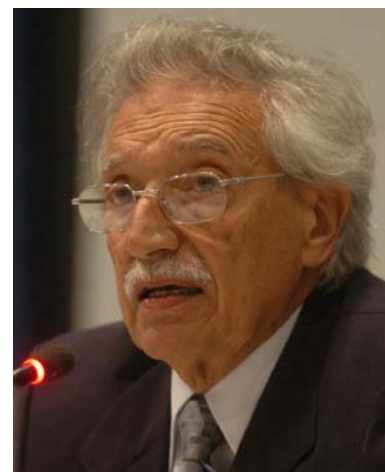
ICCM President, Mr. Mariano Arana, Minister of Housing, Territorial Planning and Environment of Uruguay.

Monday 6 February 2006 will be remembered by all participants to the International Conference on Chemicals Management (ICCM) as the decisive day in the development of the Strategic Approach to International Chemicals Management (SAICM). After three years of meetings and consultation, three sessions of the Preparatory Committee and three days of final negotiations, SAICM was finally adopted in Dubai. Agreements were reached on the three main documents of SAICM, the Dubai Declaration, the Overarching Policy Strategy and the Global Plan of Action, and on four Conference resolutions. The last minute consensus on financial considerations and principles and approaches was reached after the ICCM President facilitated final negotiations. Tired but relieved, ICCM participants could now look to the implementation of SAICM as a key tool in pursuit of the Johannesburg Plan of Implementation goal of sound management of chemicals by 2020.