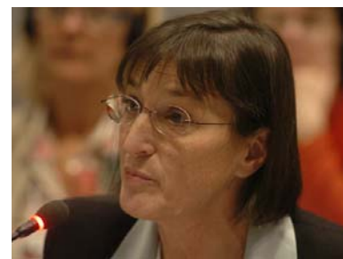
Committee of the Whole Chair, Amb. Viveka Bohn of Sweden.