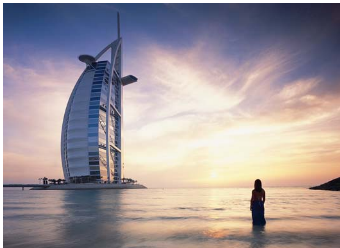
Photo/ Buj El Arab, Jumeirah

9. We commit ourselves in a spirit of solidarity and partnership to achieving chemical safety and thereby assisting in fighting po-