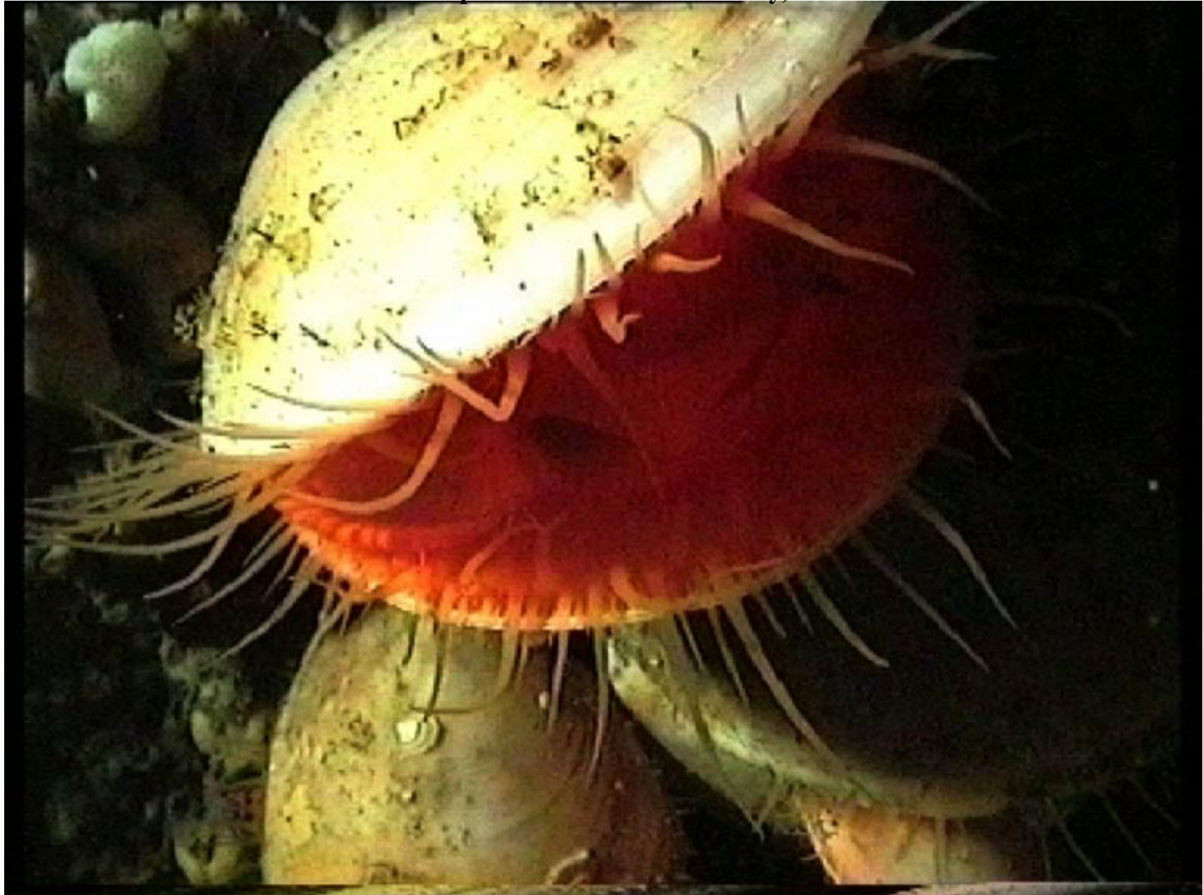
Acesta (The large clam Acesta excavata , a common member of the Norwegian Lophelia-associated community)