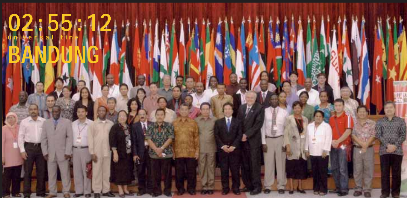
...UNEP STAFF MEMBERS AND LEGAL EXPERTS FROM OVER 40 ASIAN AND AFRICAN COUNTRIES PARTICIPATE IN A NEW ASIAN-AFRICAN STRATEGIC PARTNERSHIP WORKSHOP IN INDONESIA...

UNEP supports South-South cooperation in environmental law to assist developing countries and countries with economies in transition in strengthening environmental law and institutions and build capacity. The Bandung roadmap for advancement of environmental law in support of the New Asian-African Strategic Partnership outlines key challenges. South-South cooperation is a key aspect of the Bali Strategic Plan on capacity-building and technology support.