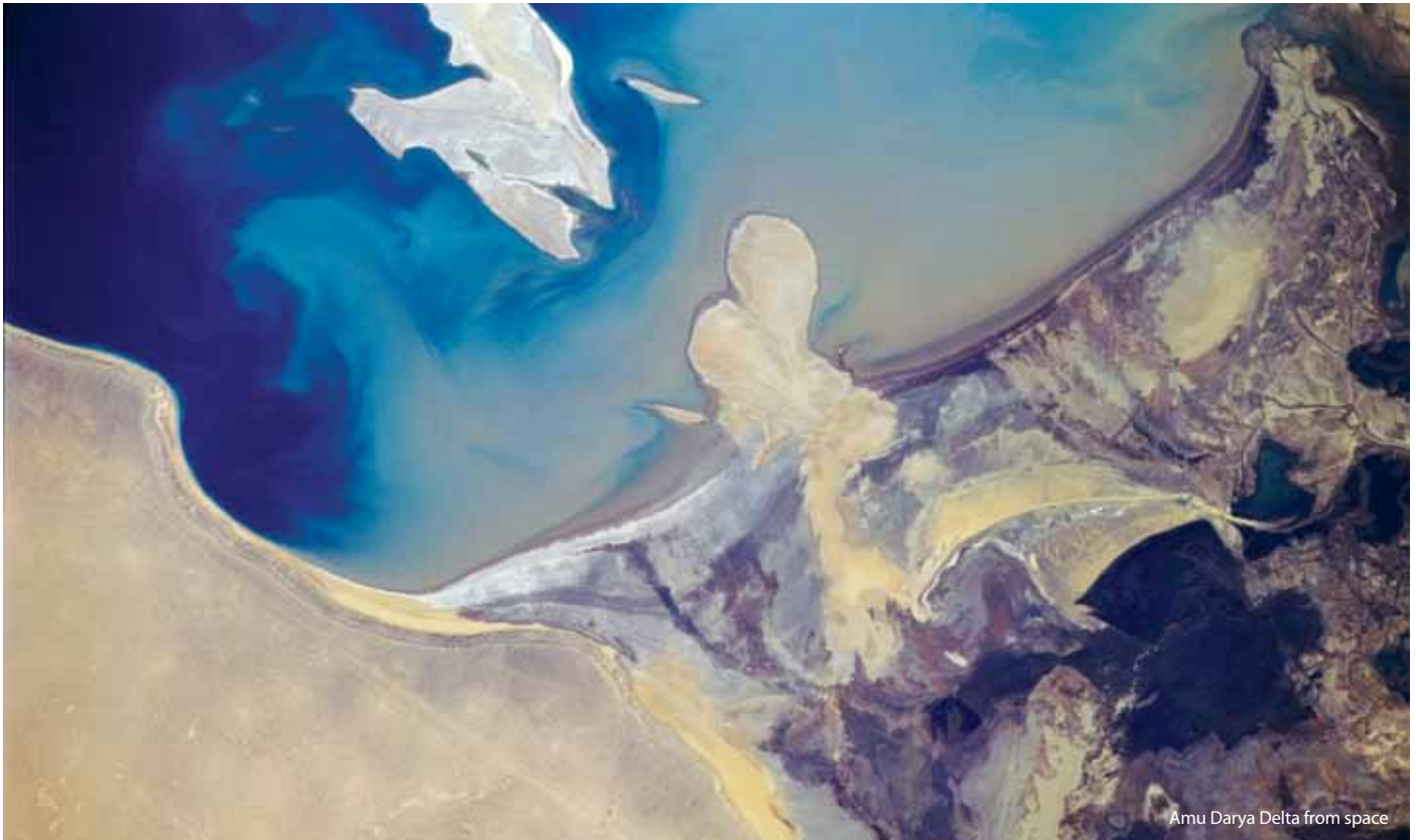
Amu Darya Delta from space