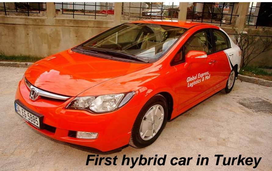
First hybrid car in Turkey

From 2006 to 2007 fuel consumption per vehicle decreased by 7% and from 2007 to 2008 by 9%.