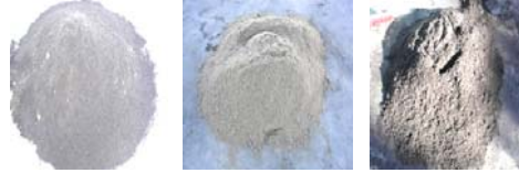
Fig 4. From left to right: pine bark, washed

The sand can be a source of weed seeds, pathogens and nematodes and so it is recommended that the sand be solarised, steamed, boiled or fumigated with Herbifume or basamid.