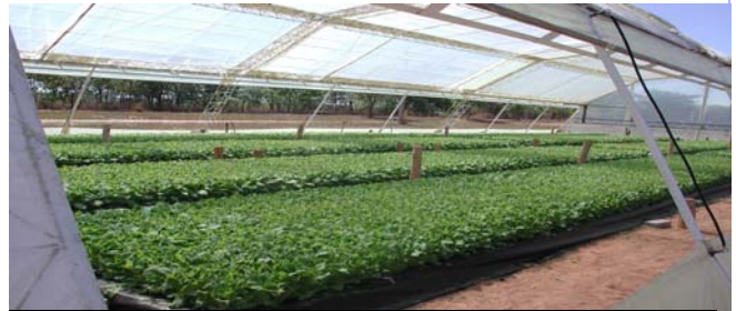
Fig 5. Float seedlings under greenhouse conditions at the Tobacco Research Board Farm, Zimbabwe