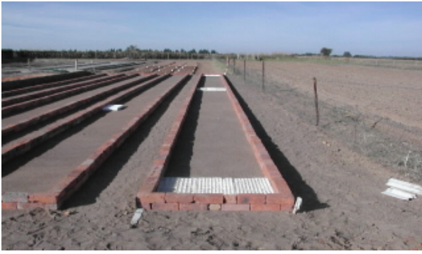
Fig 2. Completed beds constructed from loose bricks.

multiples of these dimensions are what need to be carefully considered when building the floating tray beds.