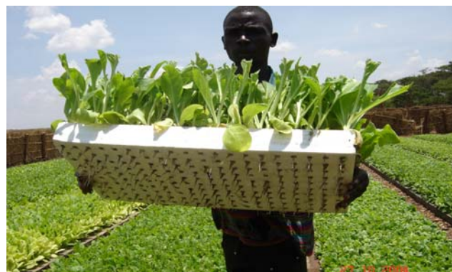
Fig 6. Excellent float seedlings at Lingadzi Estate in Malawi