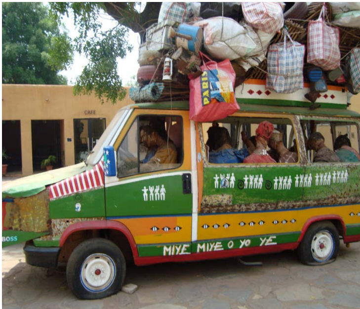
National Museum in Bamako, Mali