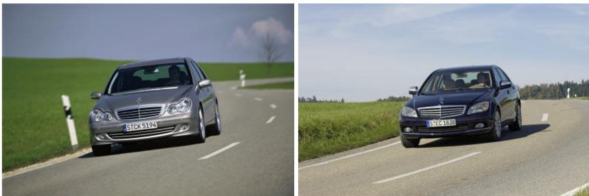
Figure 1: Mercedes C-class: old contra new (Reference: Mercedes)

Comparing the vehicle pairs we discovered many positive developments, and a standstill for some models in terms of eco performance. The tables below show the old models against a blue background for better visibility.