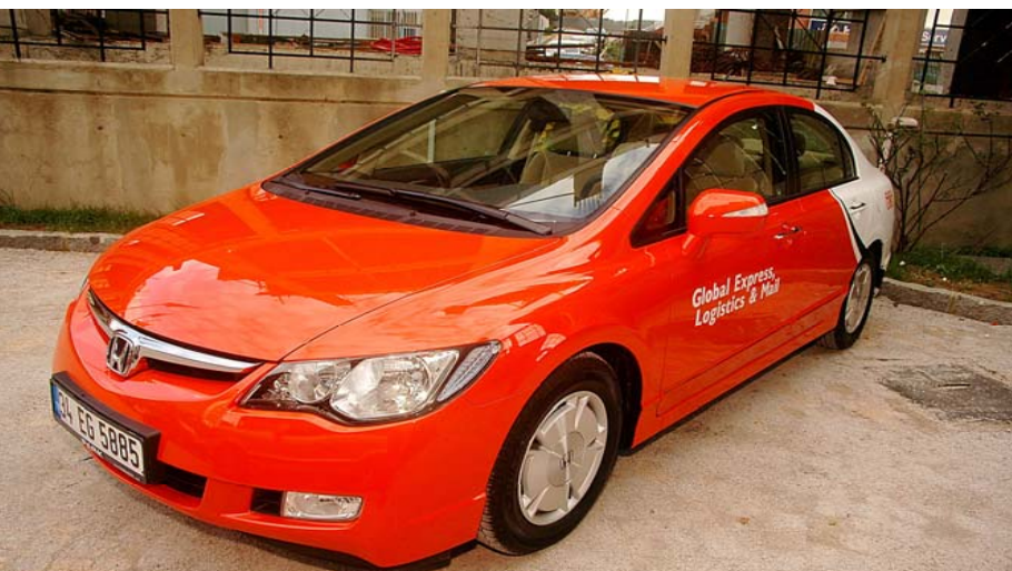
First hybrid car in Turkey