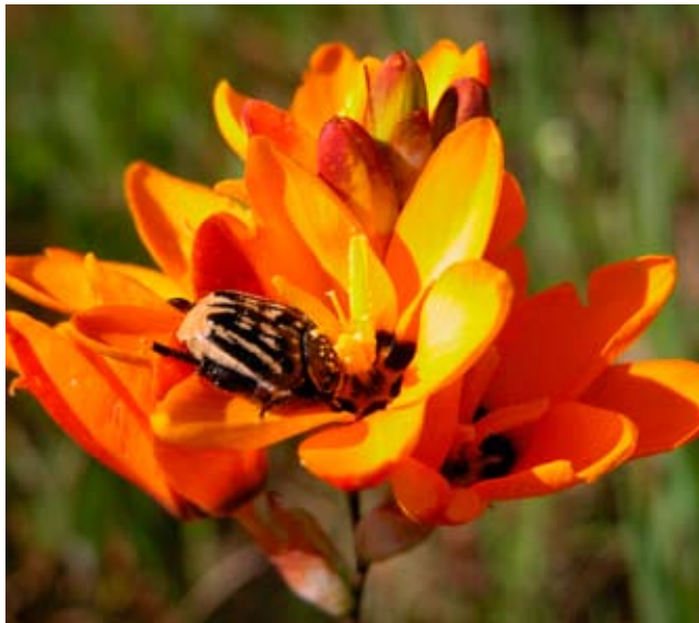
A Monkey Beetle (Hoplinidae) pollinating the Cape bulb, Ixia dubia .

Biosphere Reserves: the Kogelberg and Cape Winelands Biosphere Reserves and is nearby to the Cape West Coast Biosphere Reserve. Biosphere Reserves are established to promote and demonstrate a balanced relationship between humans and the biosphere.