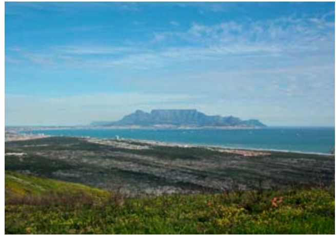
Table Mountain and Table Bay viewed from Blaauwberg Hill, showing recently burnt renosterveld vegetation at the summit.

For more info on this project, contact: Mr. Stephen Granger stephen.granger@capetown.gov.za