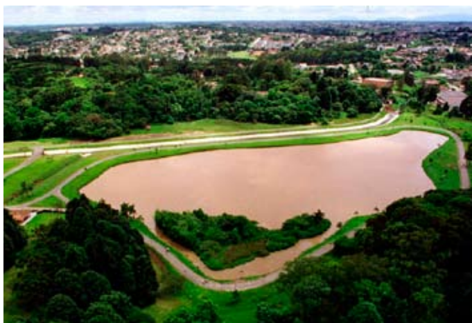
Public Conservation Unit at Tingui Parque: this 380 000m 2 unit is one of the 30 parks in Curitiba that represent the conservation of native species.

Mr. Eduardo Pereira Guimaraes edguimaraes@pmc.curitiba.pr.gov.br http://www.curitiba.pr.gov.br/