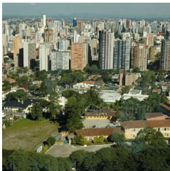
Curitiba's high rises have been designed to be integrated with open space and nature

This groundbreaking "BioCity" program on urban biodiversity, launched by the City of Curitiba, constitutes a leading example of urban planning that takes into consideration biodiversity-related issues. The BioCity programme aims to make a significant contribution to the recovery of biodiversity at the local and international levels.