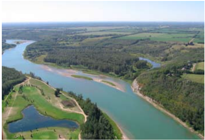
Edmonton's 'Ribbon of Green', the North Saskatchewan River Valley running through the heart of the city - a Regional Biological Corridor.

The city's recently completed Natural Area Systems Policy and companion Natural Connections Strategic Plan strengthen the city's commitment to biodiversity protection. Natural Connections sets the direction for conserving biodiversity and is based on an ecological network approach that involves identifying key natural elements at an early stage in the planning process and provides a strategic outcome based planning framework.