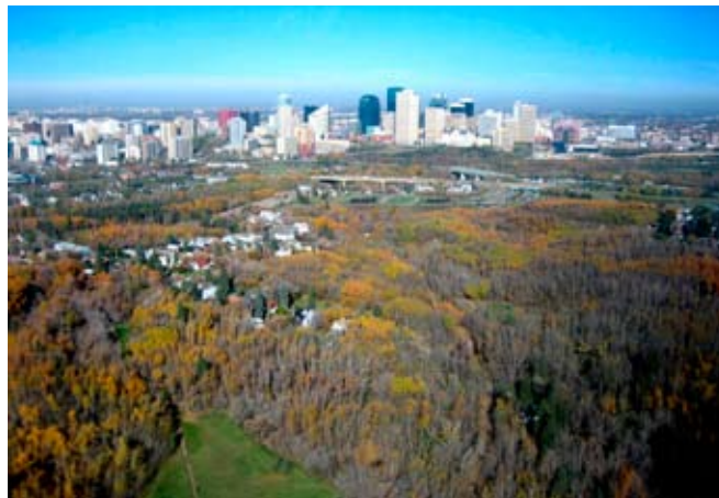
View of downtown Edmonton from Mill Creek Ravine Park - one of the Biodiversity Core Areas in its ecological network.

Edmonton's 'Ribbon of Green', the North Saskatchewan River Valley and its network of tributary ravines, runs through the middle of the city, forming the largest linear urban park in North America (7,400 hectares). This "biodiversity corridor" is supported by a system of habitat patches outside the River Valley, including forest and wetlands. Conserving this "ecological network" and the biodiversity it supports is a growing priority for both the city government and the larger Edmonton community.