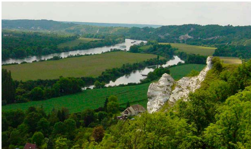
Limestone banks of the river Seine in Île-de-France

This project runs from 2007 to 2010 and aims to assure the free movement and migration of fish in the Seine River and the restoration of the banks (regional scheme for the integrated restoration of banks) and wetlands. It also aims to ensure an ecological corridor between wetlands and the main axis of the basin to improve river biodiversity.