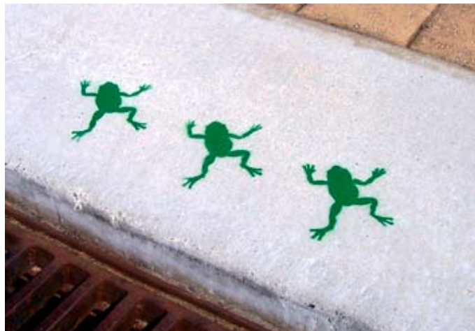
Green frogs stencilled onto local sidewalks as part of the Green Frog Stencilling project.

is extremely popular and is over-subscribed every year.