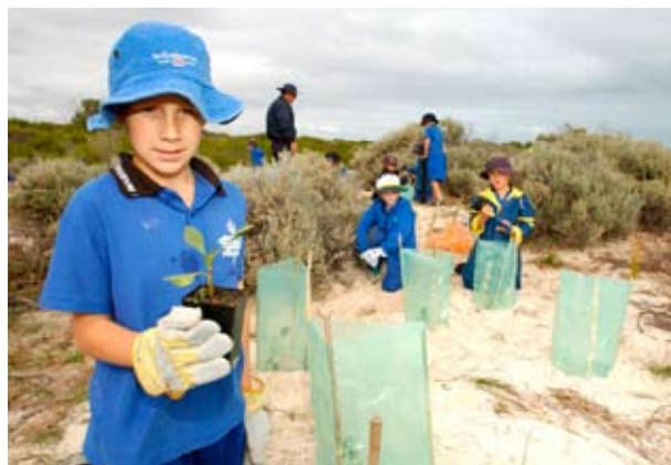
City of Joondalup school children undertaking coastal plantings as part of the Adopt-A-Coastline project

The City of Joondalup's Strategic Plan outlines specific commitments to public participation, including: the objective to engage proactively with the community and key strategies to implement and refine its Public Participation Policy and to maintain its commitment to public engagement by allowing deputations and public statement times in addition to the legislative requirements for public participation. The city's performance indicators show that the community has registered ongoing levels of satisfaction (69 – 78%) in relation to public participation and with regards to performance on conservation and environmental management (81 – 88%).