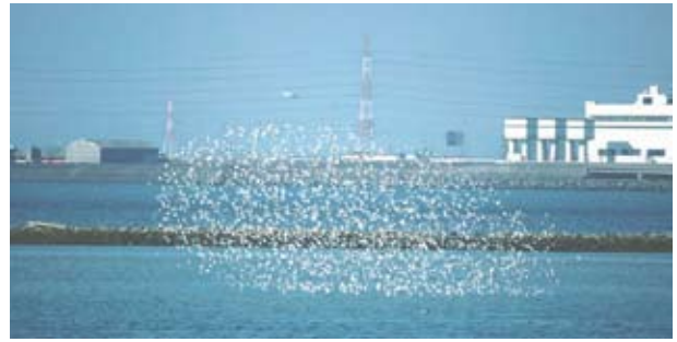
Fujimae Tidal Flat, internationally known as one of Japan's largest stopover sites for migratory birds.

by 260 percent. To achieve this target, the whole city worked to reduce garbage, by expanding the separate collection of empty bottles and cans to cover the whole city, and starting the recycling of containers and packaging (paper and plastic) in advance of the rest of the country.