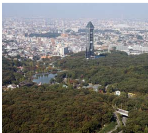
View of the downtown metropolitan area of Nagoya and the Higashiyama Forest area that spans 410ha.