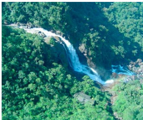
Environmental Protection Area, Capivari Manos, in the City of Sao Paulo.