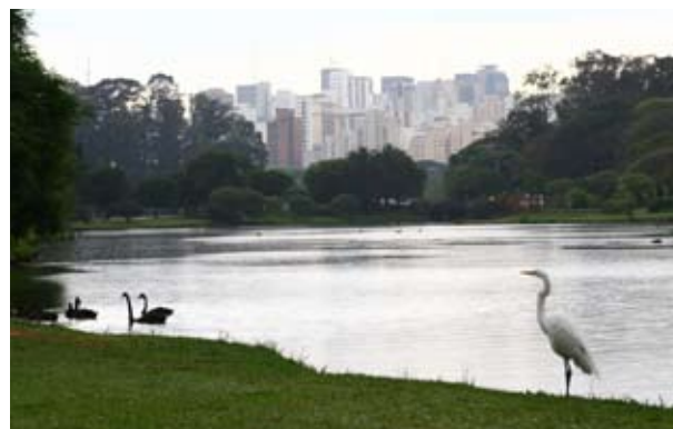
Ibirapuera Park in the City of Sao Paulo.

São Paulo is an active partner in many initiatives promoting good governance and sustainable urban management. São Paulo is promoting strict enforcement of illegal timber procurement for its buildings and works. 20% of Amazon hard wood, illegally extracted in protected areas, is consumed in the State of São Paulo. The municipal administration passed a law to secure that the timber it purchases provides all documentation of origin. The next step is to require certified timber for municipal construction.